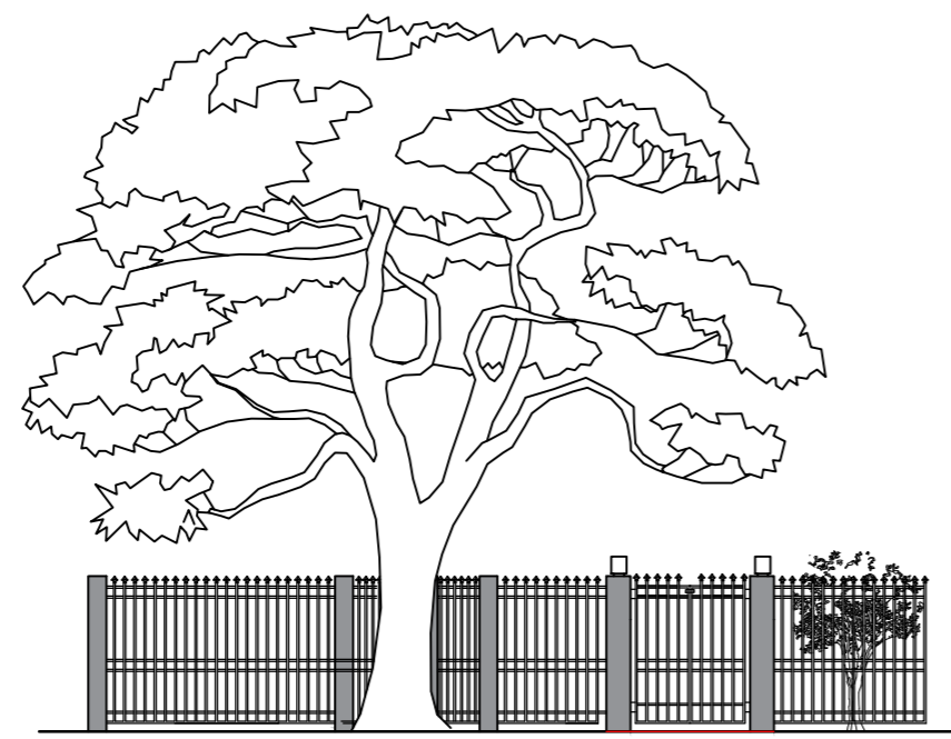
ELEVATION - A